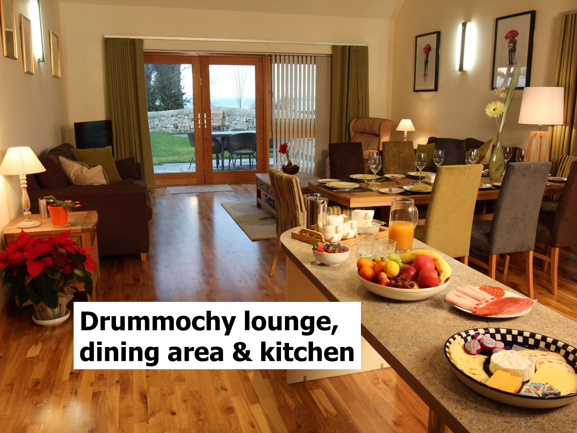
Drummochy lounge, dining area & kitchen