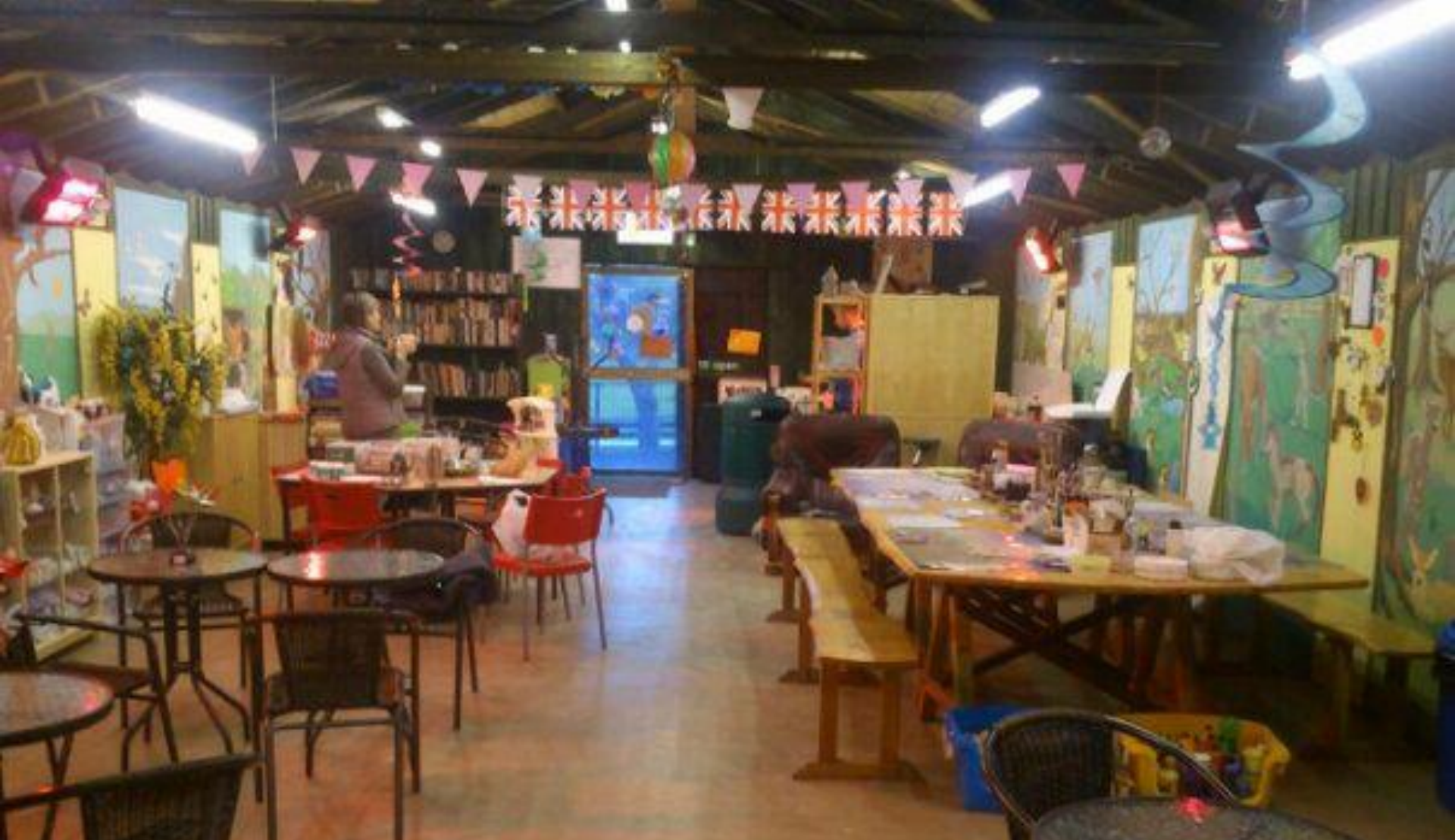
Letham Glen Craft Centre