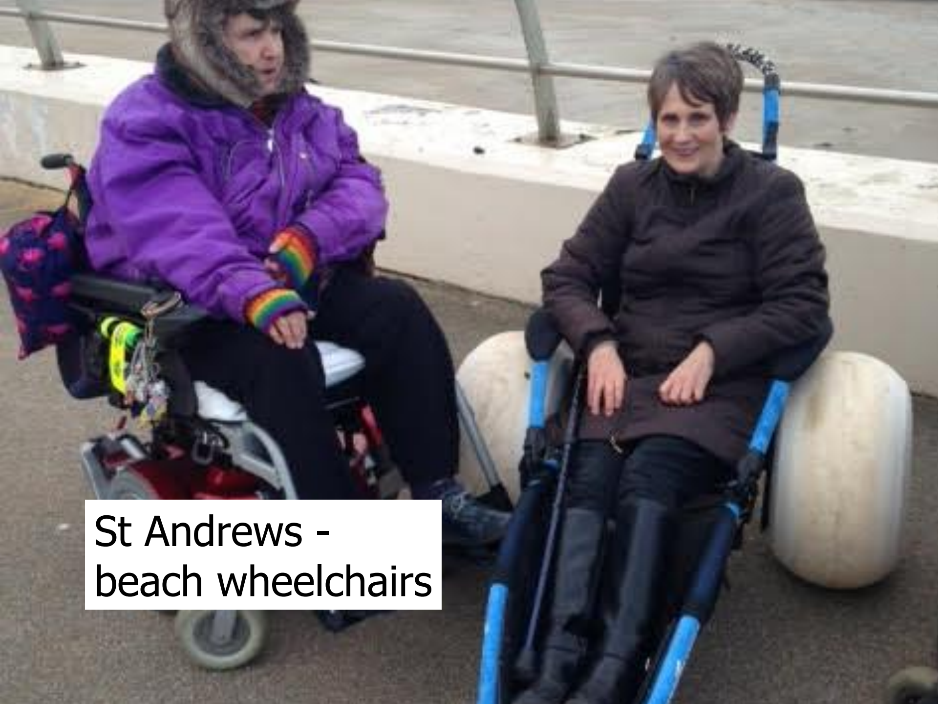
St Andrews - beach wheelchairs