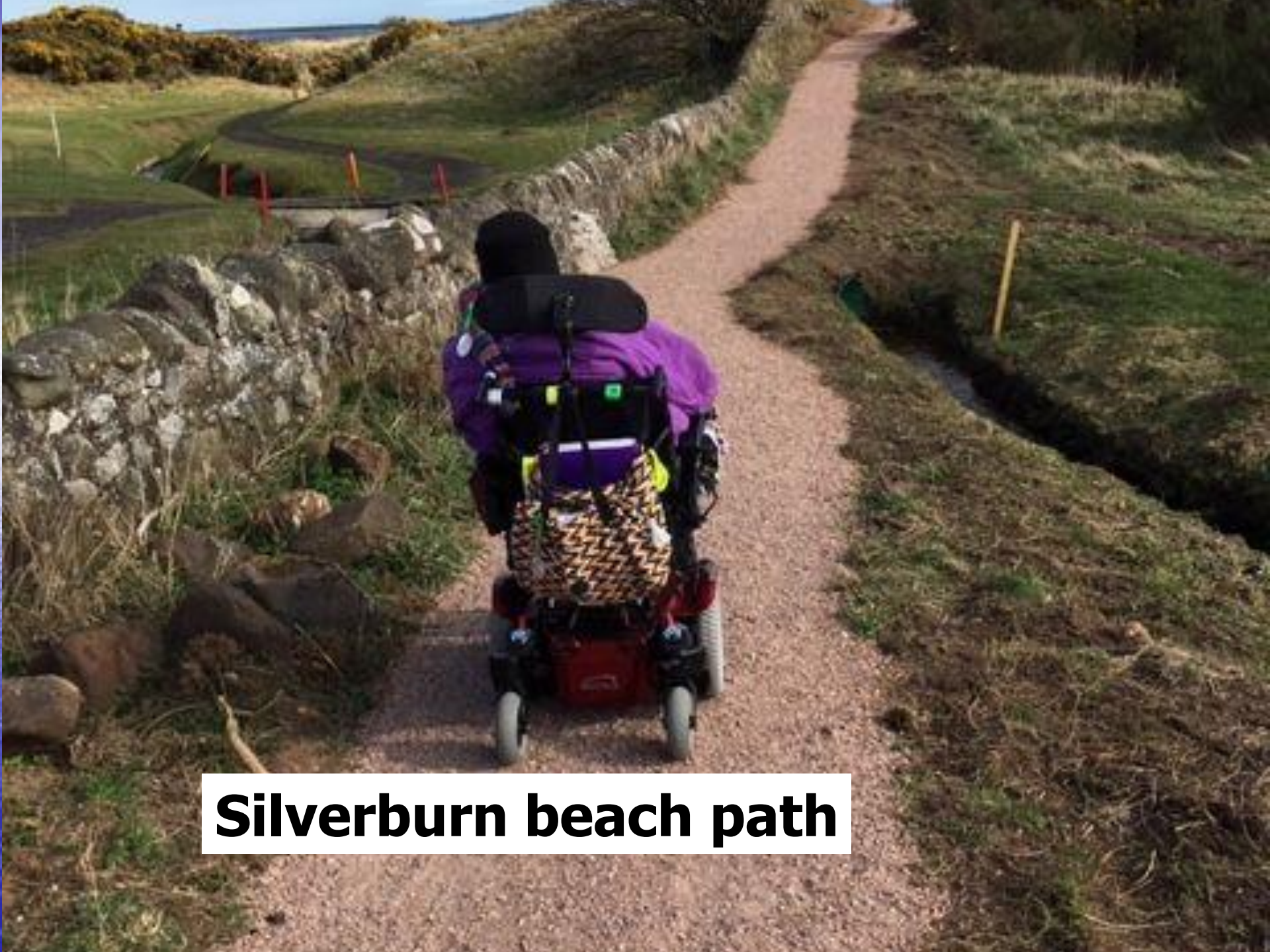
Silverburn beach path