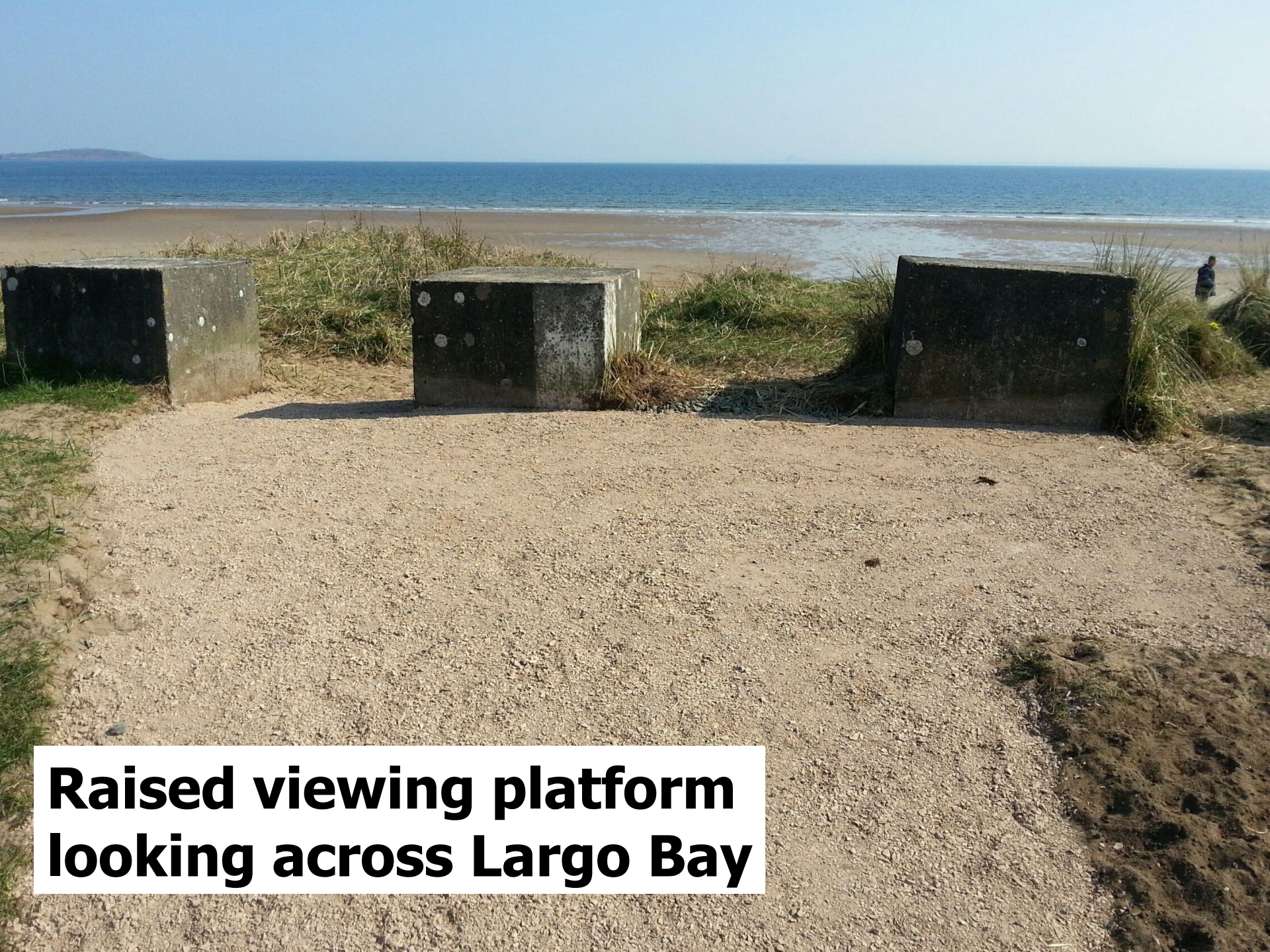
Raised viewing platform looking across Largo Bay